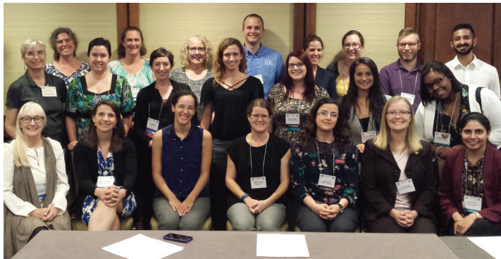
Figure 2. Women in Acoustics Committee Meeting in Honolulu, November 2016

research, and/or service to the field. The WIA luncheon is a highly successful and well-attended event.